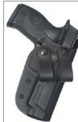
An IWB holster from Blade Tech similar to the one lost in mis-logged evidence, though this example holds a S&W M&P, not a Glock.