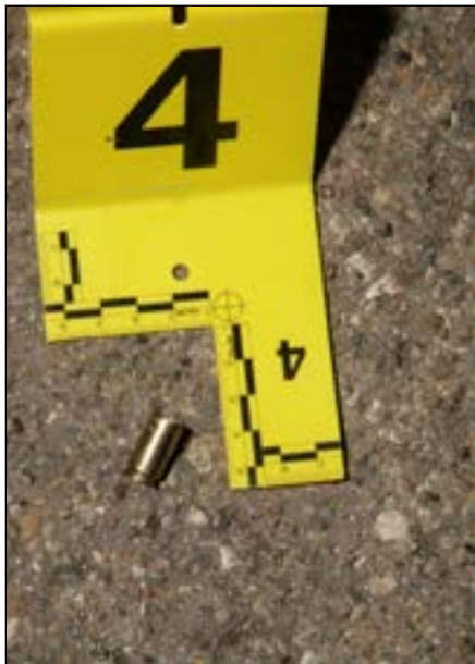
Even small things like empty shell cases ejected from a semi-automatic pistol can fill in gaps in a crime report, if they are discovered and their location put into perspective with the rest of the scene.