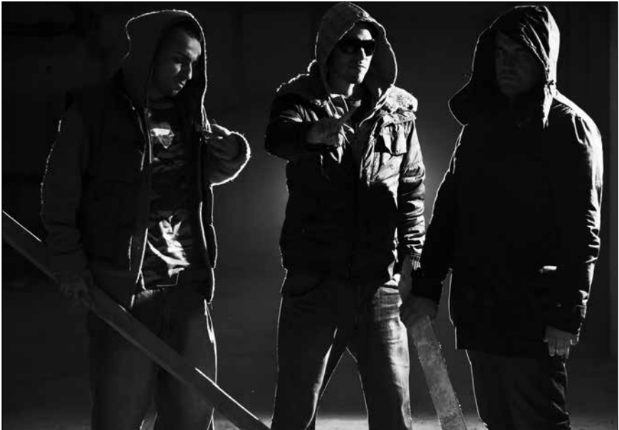
An argument that disparity of force existed may be used when multiple assailants attack.

Legally speaking, likely it was lawful for the defender to use force in self defense, but in court the claim is made that he or she used excessive force. Under these circumstances, the defendant will need to show the jury, or a judge