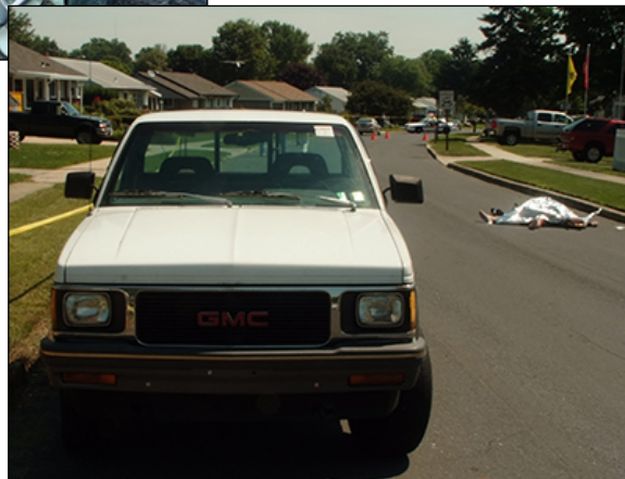
Crime scene photo shows position to which Newcomer had moved his truck to allow ambulance access to Wintermyer.

Newcomer: Correct, they took me to the hospital then to the police station, but they never talked to me after that.