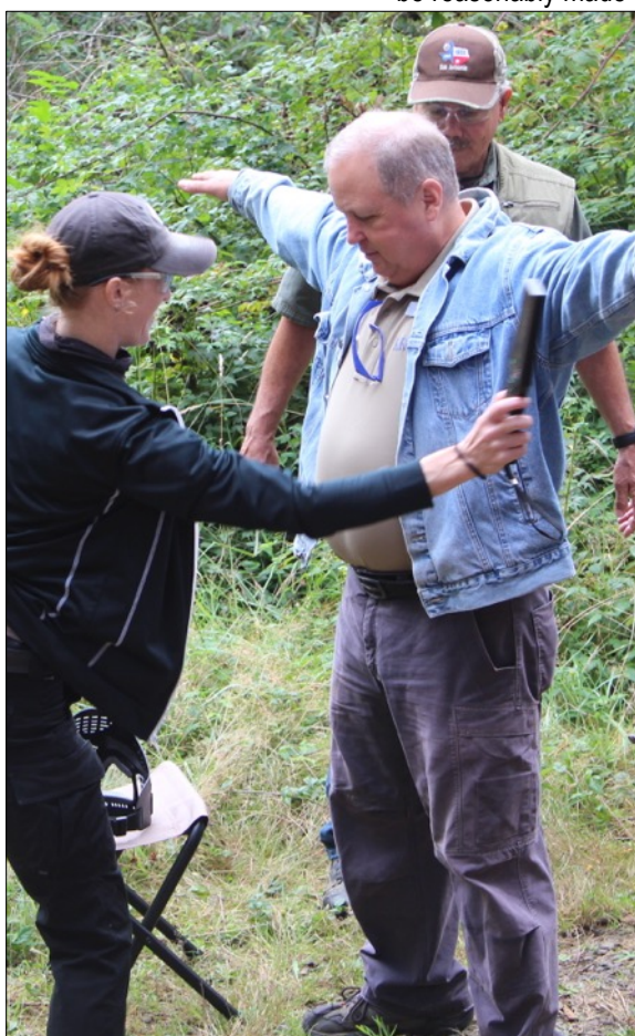
My school uses metal detector wands prior to bringing students into force on force scenarios as an added layer of safety to prevent inadvertent introduction of a real weapon into the scenario.

If you do not have a local recommendation or do not have the money to travel, consider sponsoring one of the traveling trainers who do this. As sponsor, you may get your training for free, and make a new, life-long friend.