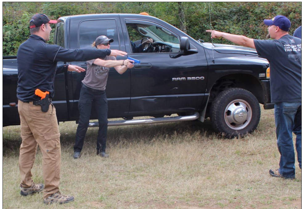
Students and instructors role play a parking lot confrontation using plastic castings of guns as props, working through verbal commands, positioning and other tactics.